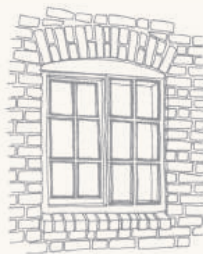
Yorkshire sash window with arched brick lintel and sloping brick cill