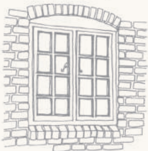
Casement window with arched brick lintel and sloping brick cill

They are predominately vertical sliding sashes or horizontal Yorkshire sliding sashes set beneath arched brick lintels and with either brick or stone cills. It is their proportion to the scale and dimensions of walling which gives the structures their character and charm.