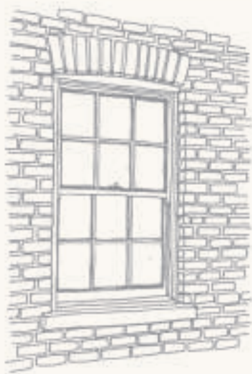
Vertical sash window with traditional glazing beads, arched brick lintel and projecting stone cill

There is not a single style of window design within the original properties in the village.