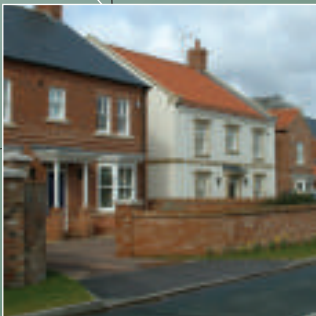
Askham Fields Lane