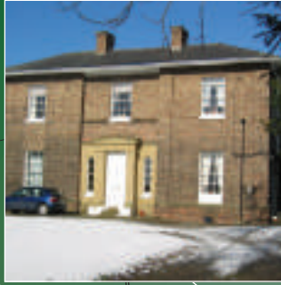
Askham Bryan Hall