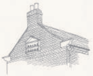
Raised Gables and corbelled kneelers

Roofing materials are generally either clay pantiles or blue slate. Those that predominate do characterise the village and contribute considerably to its landscape. Rooflines are important and the design of chimneystacks adds visual interest. Most in the village are topped with projecting brick courses and simple clay chimney pots.