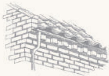
Raised gable with stone copings and projecting brick course eaves with dentil detailing

Roofing materials are generally either clay pantiles or blue slate. Those that predominate do characterise the village and contribute considerably to its landscape. Rooflines are important and the design of chimneystacks adds visual interest. Most in the village are topped with projecting brick courses and simple clay chimney pots.