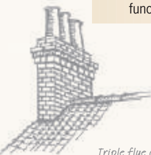
Triple flue chimney with angled brick detailing