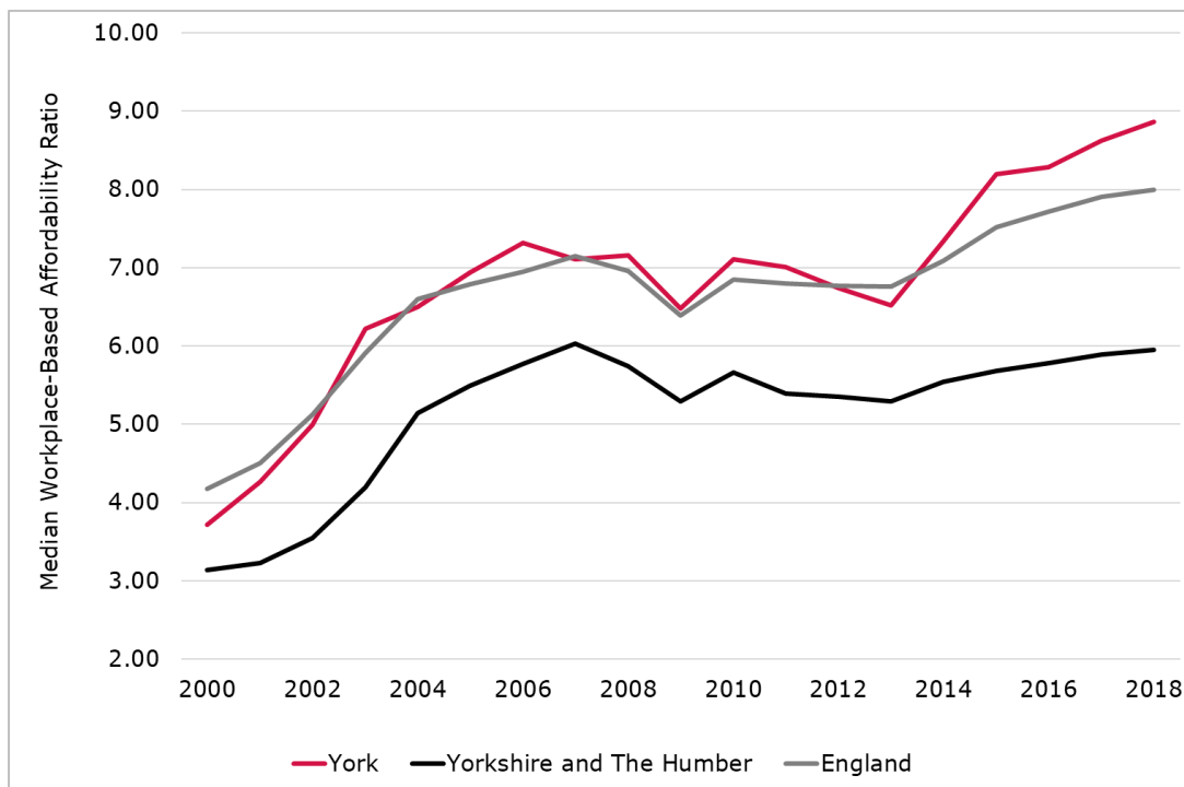
Figure 2: Median workplace based affordability ratio