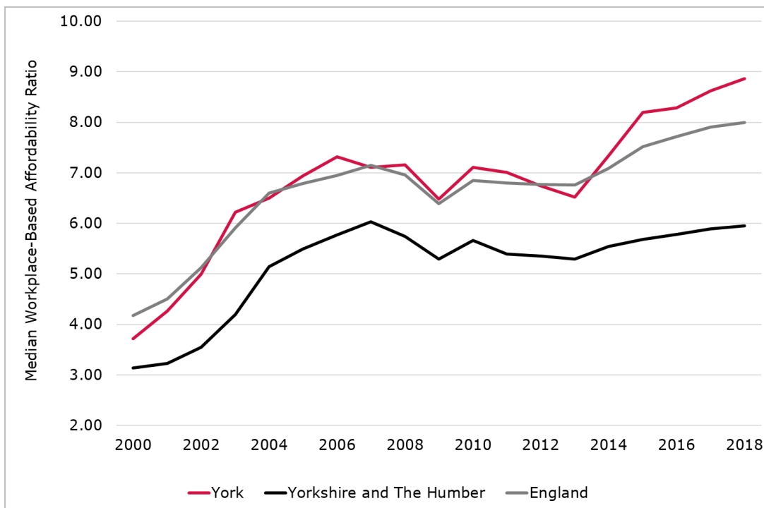
Figure 2: Median workplace based affordability ratio