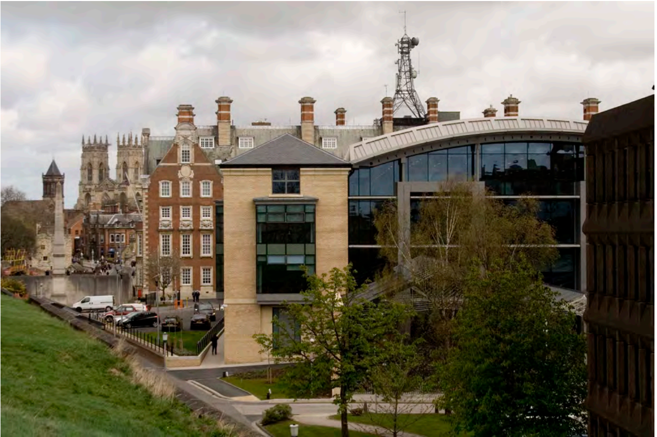
The Minster from the city wall with the converted 1840s railway station in the foreground