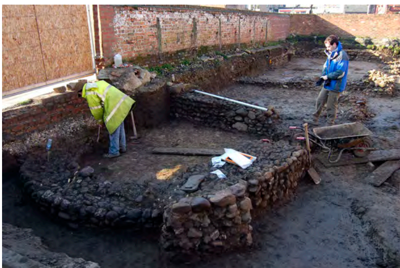
Foundations of the medieval church of All Saint's, Fishergate.

6.28 Archaeological deposits can be found throughout the City of York area. All areas within the City of York have the potential to preserve archaeological features and deposits. Detailed characterisation of the archaeological features and deposits within this area is a complex process beyond the scope of this paper. This section therefore attempts to provide simple, high-level character statements which can be used to assess the impact of Local Plan policy statements.