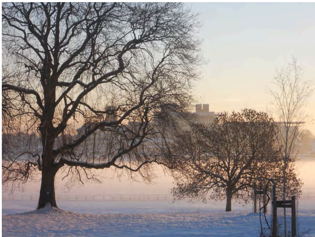
The Knavesmire, part of Micklegate Stray and an important part of York's green infrastructure.

6.30 Its relevance lies in the conglomeration of layers and relics of old landscapes, in part conserved through time by continuous administration, absence of development, and centuries of traditional management. It is the combination of the various elements such as the lngs and strays that provides York's unique make up. The natural environment is significant in its concentrated collection of a variety of examples of historically managed landscapes, represented for example by wild flower meadows, lowland heath, valley fen, strip fields, veteran orchard trees, species-rich hedgerows. Many of these otherwise isolated remnant landscapes link up with other open spaces resulting for example from our industrial or war time past, to form often accessible tracts of subtly diverse landscapes; thus the landscape/natural heritage is much greater than the sum of its parts.