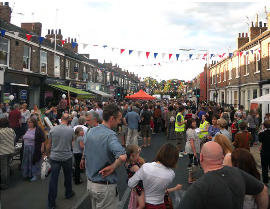
The thriving shopping centre of Bishopthorpe Road during an annual street party.