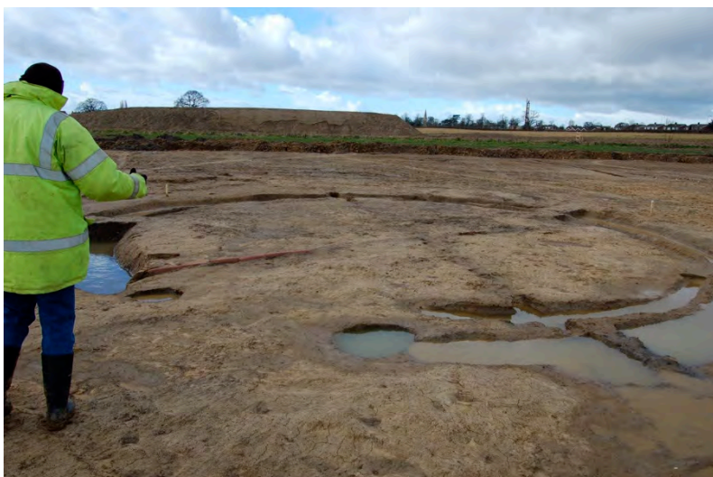
Iron Age round house ditches at Campus 3, Heslington.