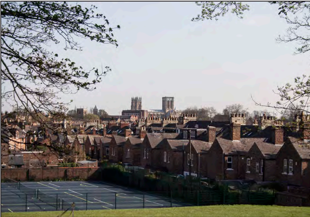
View from the grounds of Millthorpe Secondary School, one of the rare areas of relatively high ground in York.