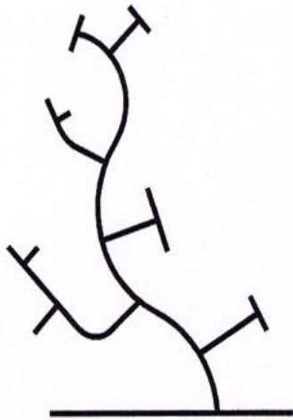
a) Tree-Like Layout