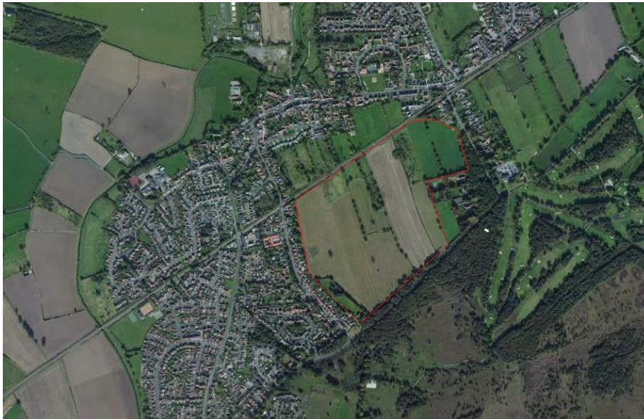
Figure 2: Southern Parcel Land South of Strensall