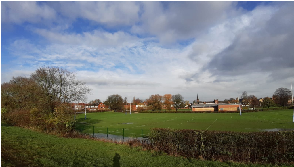
1. Pmm18: Open Vista from the Flood Bund