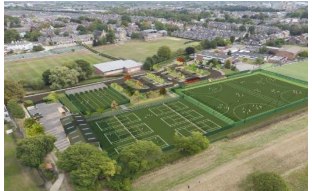
2. Current GB looking west over school grounds; bottom left to middle right Note tennis courts and artificial pitches to left. School plans to cover the remaining 8 acres with much more and a car park