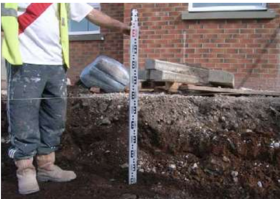
Photograph 4: Depth check of inert cover within areas of front gardens.