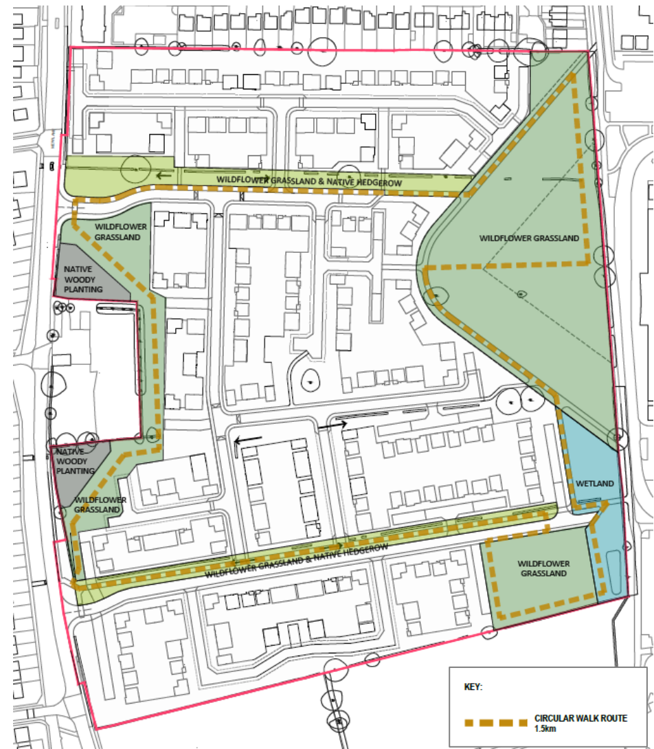
Figure 5 Provision of open greenspace within Layout.