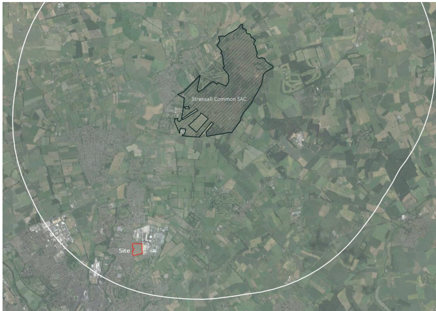
Figure 2 Relationship between the Site & Strensall Common SAC (5.5km radii shown).