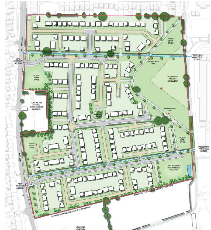
Figure 3 Illustrative masterplan