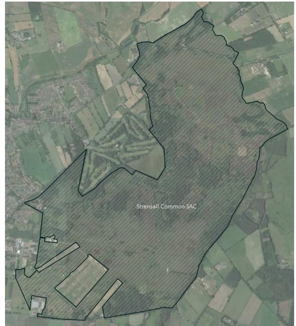
Figure 4 Strensall Common SAC